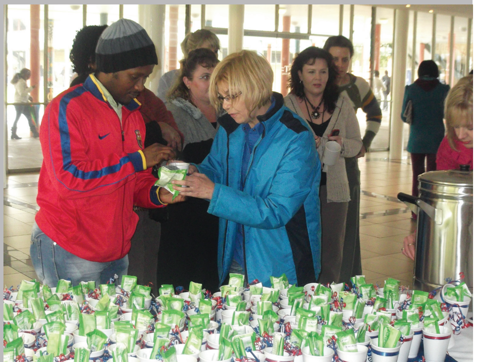
NTEU spoiled VUT community with a cup of soup

The BEC wishes to extend its gratitude to all staff members who made the effort worthwhile, and believe that the spirit of unity was revived.