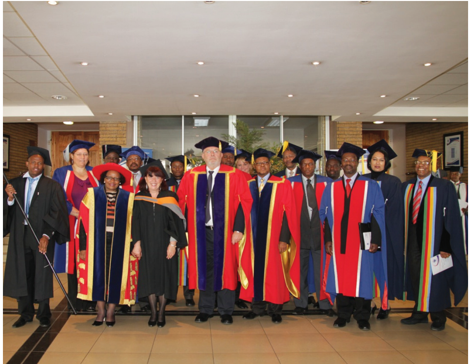
VUT procession during one of spring graduation ceremonies

Guest speakers from various industries shared their knowledge and emphasised that the day marked a new chapter in the graduates' journey of success. Some speakers reminded the new graduates of key principles, such as self-discipline, perseverance, self-motivation and focusing on the vision which will help them to