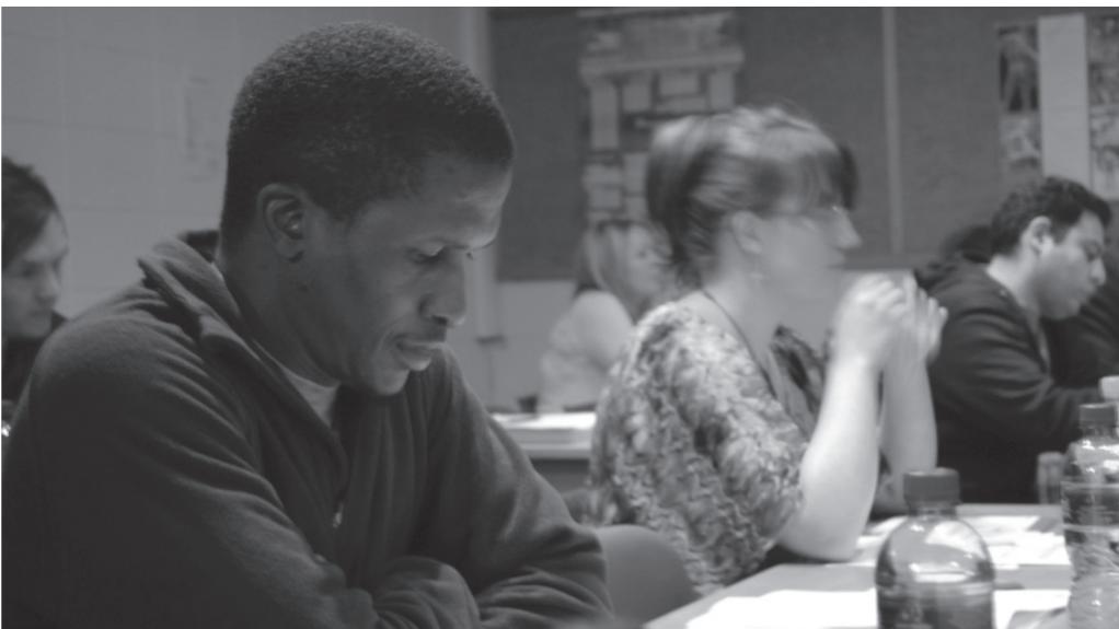
VUT staff and students attended the research seminar