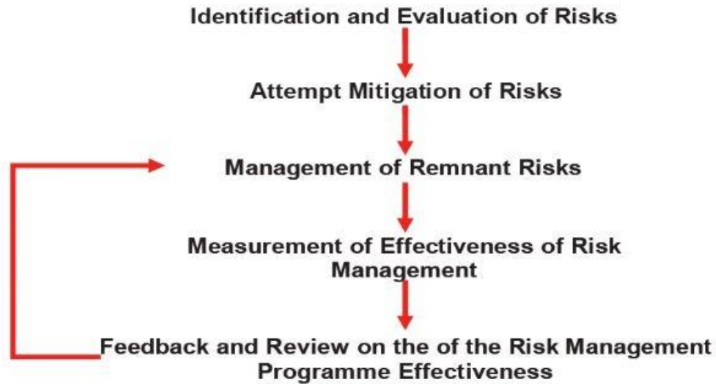
Figure 1 Generic Example of a Risk Management Approach